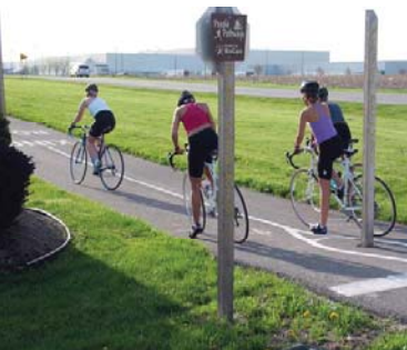
Ride for Ridpath School PTO