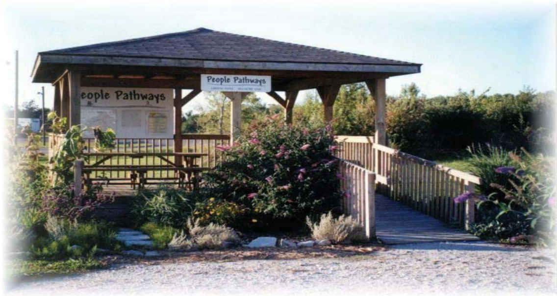
People Pathways 2012

The People Pathways effort in Greencastle, Putnam County was started in the fall of 1995. The mission was established to enhance the quality of life of our community by developing a network of multi-use trails to promote community connections, interaction, good health, safety, and non-motorized transportation. People Pathways is a not-for-profit group that functions under the umbrella organization of the Friends of the Park Association of Putnam County.